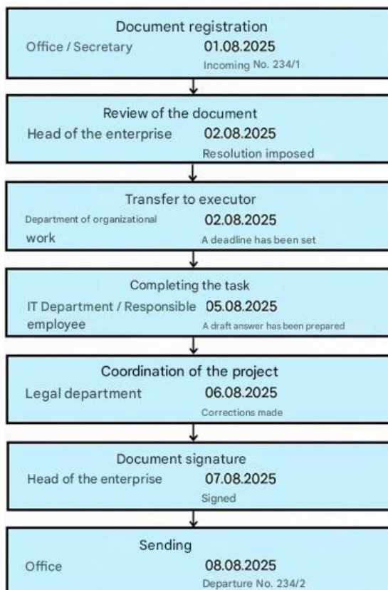
Fig. 1 Example of a document flow chart

To describe information flows between the units of an automation object, we will give it a definition. Information flow is a combination of two concepts: an information flow scheme and an information flow element.